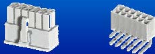
CP Power Connectors